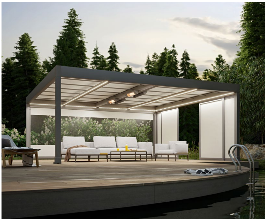
Your very own personal space in the open air